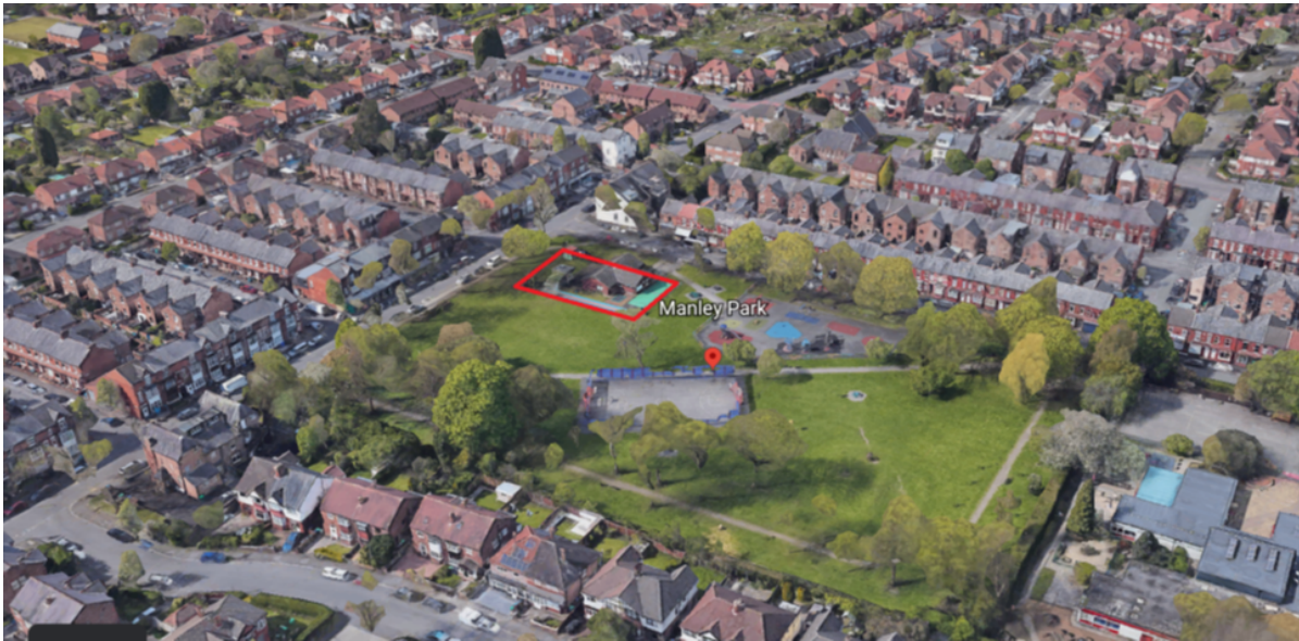
Site location in respect of the wider park

The application site relates to Manley Park located on York Avenue within the Whalley Range Ward and in particular the existing building located in the south western corner of the park. There are trees bounding the park, which contains grassed areas and areas of hard standing in the form of basketball court and children's play area. The streets to the east and west are predominantly residential in nature with more mixed commercial/residential three storey terraced properties to the south along Clarendon Road. Manley Park Primary School borders the park to the immediate north.