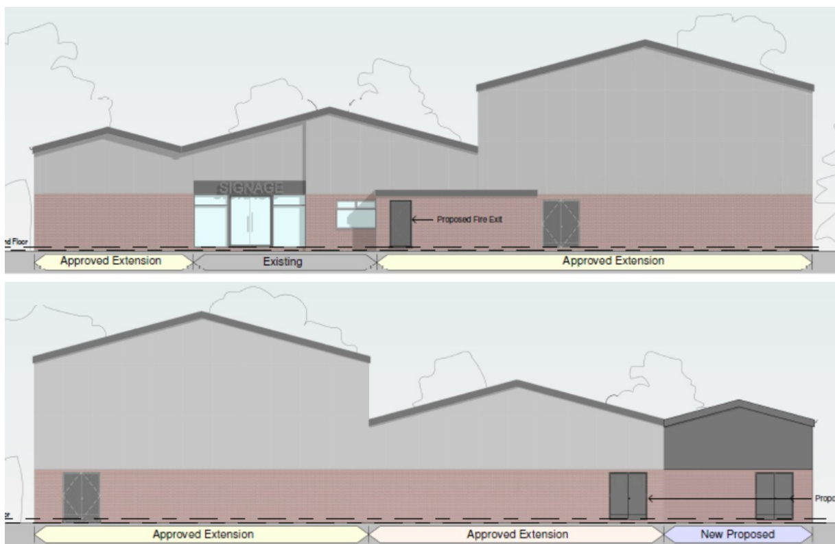
Front York Avenue elevation (top) and rear elevation (bottom)

Visual Amenity – The proposed development in this location on this site would result in a visual change in the locality given the open nature of the site adjacent to the current low level community centre. The overall level of change has been previously considered to be acceptable through previous planning approvals and the principle of the changes to visual amenity and character of the area have been accepted. However, the proposed extension has been designed to respond to the general character of the area and would be of a modern design utilising facings to match the previously approved extensions, together with a metal cladding to the upper half of the building. The applicant had submitted details of materials to be used on the external envelope of the building to discharge the relevant condition on the previous approvals. These materials were considered to be acceptable and this is to be reflected in any approval granted to these proposals.