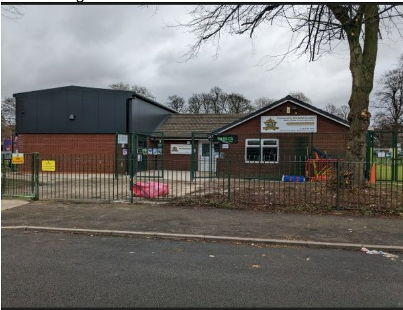
Front elevation of the Centre (new recently constructed extension is to the left)

The existing single storey red brick building on the site within the park is used for community use purposes with fenced external play areas to the north and south of the building.